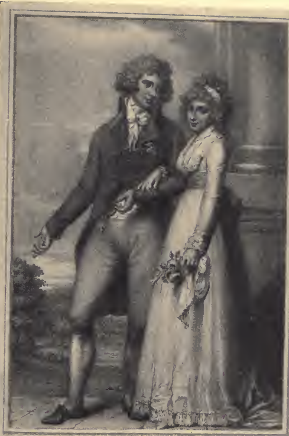
THEIR ROYAL HIGHNESSES the Prince and Princess of Wales